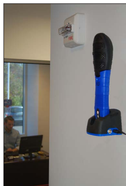
Remotely access ▲ units set up for continuous monitoring.

Access the full range of GrayWolf parameters via WiFi enabled AdvancedSense®, WolfPack®, WS-LAP PC or stand-alone Particulate meters. ▼