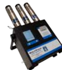
WolfPack Area monitor