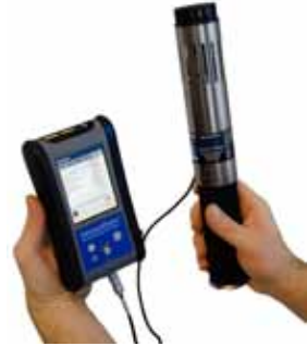
AdvancedSense with IQ-610

PCC-10 Hard-shell Security case for in-situ monitoring