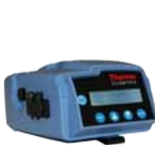
PM-205 Particulate meter