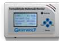
FM-801 Formaldehyde meter