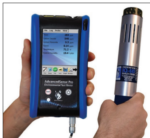
GrayWolf AdvancedSense Pro IAQ Meter

(albeit time-tested) methods requiring an air sample to be sent to a lab for analysis. Samples might be collected into various containers or onto various media. Lab tests on the samples include gas chromatography identified by mass spectroscopy (GCMS), high performance liquid chromatography (HPLC) and others. For instantaneous results, a portable, high quality instrument may be a more practical approach.