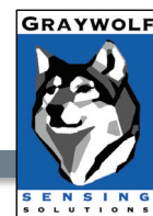
GrayWolf specifications for select parameters