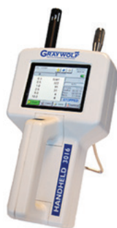
GrayWolf PC-3016 Particulate Meter

Another important measured parameter is particulate. GrayWolf offers 2 different technologies. GrayWolf's nephelometric (i.e. photometric) PM-205 scatters light from a laser diode at 90° within a sample chamber. The index of refraction, size, and density all effect the amount of scattered light. A lens focuses the scattered light to a photo-detector which converts the light into a voltage which will be proportional to the mass concentration of the aerosol (assuming that the aerosol is the same mass as the calibration material that was used). The range for the PM-205 is very precise and repeatable from 0.1 to 10 \mu m, and will detect particles up to ~25 \mu m.