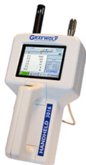
GrayWolf PC-3016 Particulate Meter

The more popular GrayWolf particulate technique also measures particulates via light scattering, but sorts them into 6 “bins” based on size. These particle counters have a laser light source which the particle will pass through, and the redirected light will be measured by a detector. The amplitude of the light redirected or obscured has a unique signature that relates to a specific size, and determines the quantity of particles present. Based on the flow of the pump and with the assumption that all particles are carbon, mass concentration can be estimated. GrayWolf’s laser particle counters have an optimal range from 0.3 - 10 µm, although also detect up to ~25 µm.