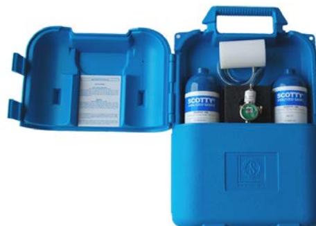
User gas calibration kits are available from GrayWolf

The GrayWolf equipment has the ability to be verified and, if appropriate, adjusted by the end user with traceable reference gases at any time. This allows for even more confidence in any subsequent testing of the GrayWolf meters against other devices. Any user calibration adjustments are recorded for inclusion in reporting.