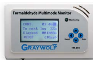
GrayWolf FM-801 Formaldehyde Meter

Formaldehyde (HCHO) is a VOC that is worth speciating, as it is a known carcinogen, even at low levels. IAQ specific HCHO regulations are typically <100ppb (e.g. Japan 80ppb 6 , Hong Kong 50ppb 7 , LEED 27ppb 8 ). CMOS, and certain PID sensors for TVOC will detect formaldehyde as any other VOC lumped into the TVOC value. Electrochemical sensors for monitoring formaldehyde, occasionally used in low cost monitors, have high cross-sensitivity to CO, and are heavily influenced by relative humidity. Sometimes the LOD of an electrochemical sensor will even be above the concentration of interest for IAQ.