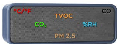
Multi-Sensor IAQ Box

A variety of technologies are available for real-time measurement of indoor air quality (IAQ), and there are many parameters of concern. In this age of the “internet of things”, a number of companies worldwide (most of them start-ups) are offering various wall-mount or table-top boxes full of low cost sensors for monitoring IAQ. Some are marketing fixed sensors for demand control ventilation (DCV) designed to control ventilation rates, typically based on carbon dioxide (CO 2 ) concentrations. While most are attractively priced, are these devices reliable?